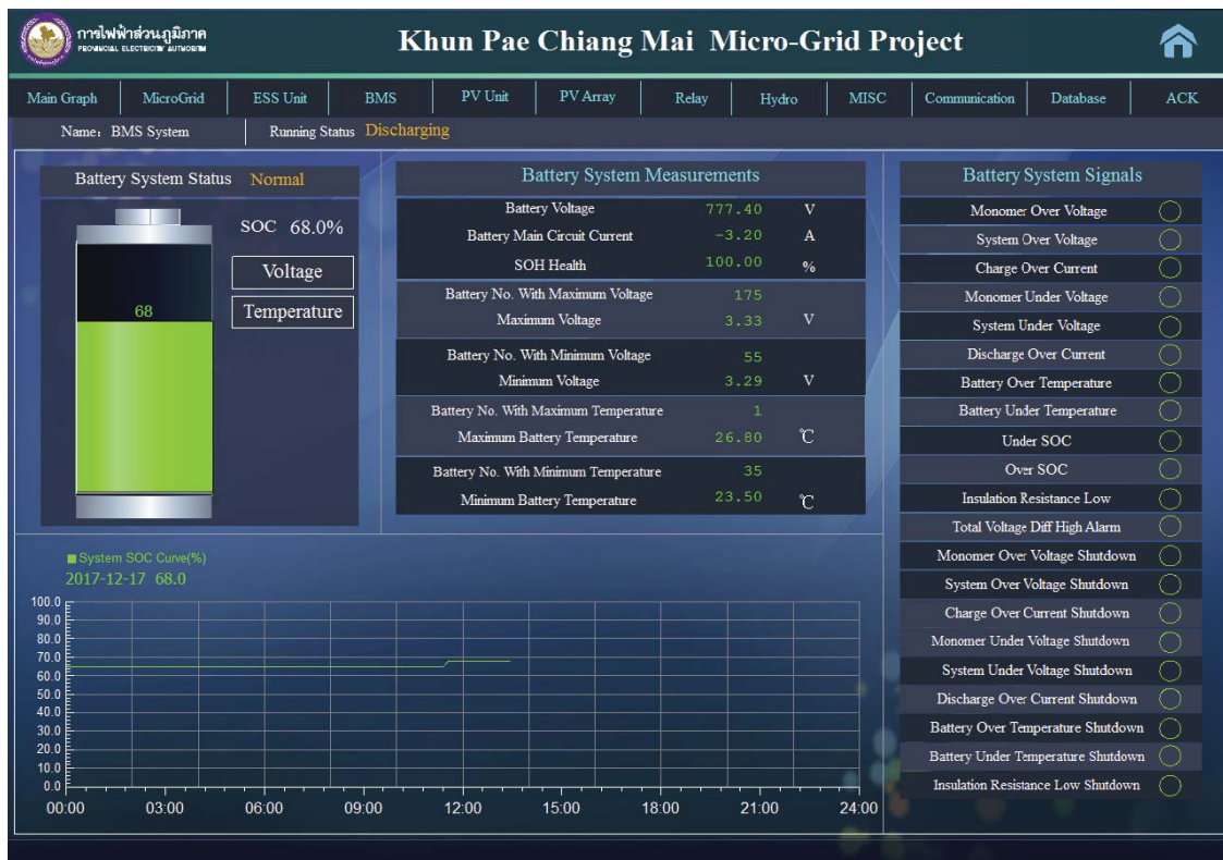
Figure 2 Control & monitoring of PCS-9700ESS Battery Management System